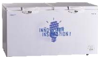
Double Lid Chest Freezer / Chiller CF-500