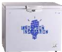
Chest Freezer / Chiller CF-300